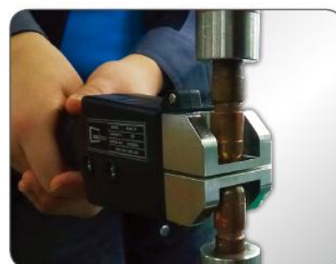
Insulated load cell