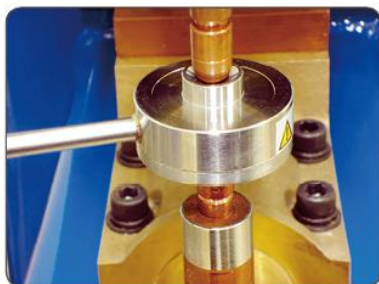
load cell upper sensor part